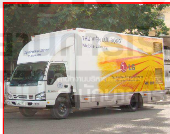
Figure 1: Car mobile library of the General Science Library in Ho Chi Minh City

In Vietnam there has three libraries established thus new way of rotation of books to support readers in remote areas. They are General Science Library if Ho Chi Minh city, Public Library if Hanoi city and Public Library of Yen Bai City. It considered a new model of rotation of book in Vietnam. By such way, readers in rural zones can have a chance to read new books support to their current needs comprised of knowledge , information, entertainment and others. The method is more useful for minority groups and soldiers who live in border regions which is isolated from society.