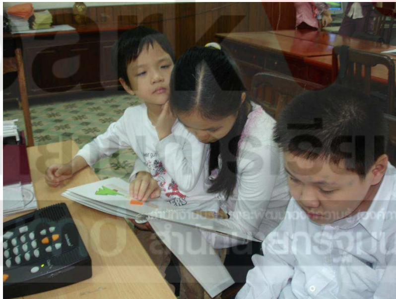
Figure 3: General Science Library in Ho Chi Minh City with visually impaired children

It is very happy that since 1999, Minister of Culture - Sport - Tourism of Vietnam has been supported some public libraries in big city such as Public Library of Hanoi and General Science Library of Ho Chi Minh city to provide service of touching letter room for such visually impaired people. Up till now there are 34 other such rooms have opened to serve visually impaired people in different provinces. However, there are a few people to come to library reading braille books. It is clear that to learn to read braille need more times for training them. On the other hand, due to travel difficulty for them, they did not want to go to library. So it is useful to transfer braille books to visually impaired union. By this way reading activity for such people will be done well. In fact, some public libraries of the country have collaborated with visually impaired unions in order to increase activities in terms of training and introduction braille books for such poor people. There are some braille book contests to hold in different cities for blind people to help them a opportunity to learn and improve their knowledge for portion of their quality of life.