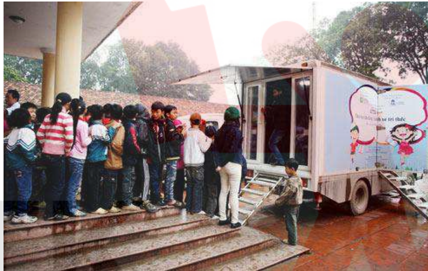
Figure 2: Mobile Library- Knowledge Wheel of the Hanoi Library service in the suburbs of Hanoi

The public library of Hanoi has one book vehicle with 1500 books and 6 connected Internet computers to serve 10 poor villages in the city. The library has planned for three future years that every weekend this vehicle run to work with the aim of supporting pupils in the village to learn from reading and use of internet effectively.